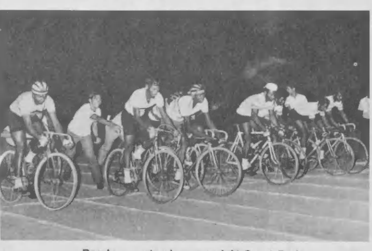
Ready.... steady.... go! At Sport Park